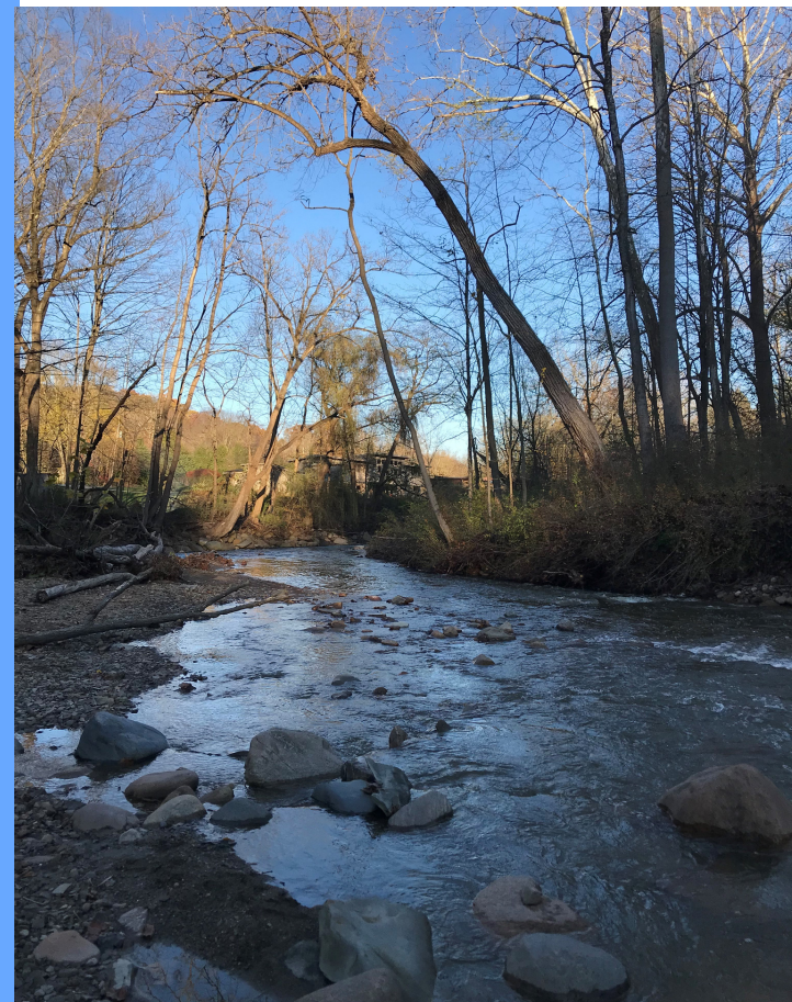
Summit County Watersheds