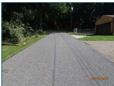
Top: Deteriorated Township roadway